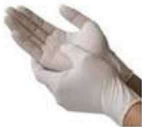
G L O V E S