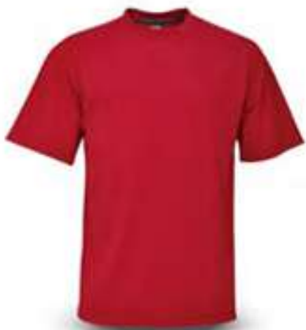
CLASSIC SPORTS T-SHIRT