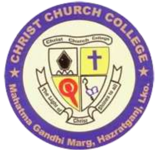
CHRIST CHURCH COLLEGE