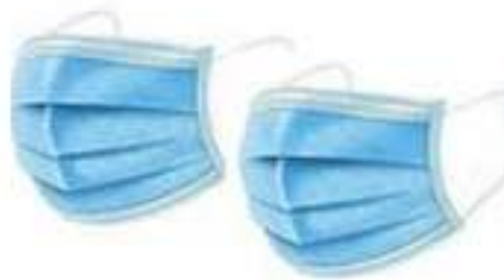
M A S K S