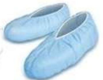
S H O E C O V E R