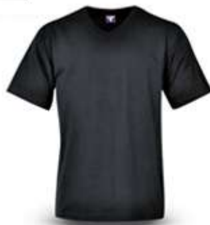
CLASSIC V-NECK T-SHIRT