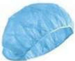
C A P S