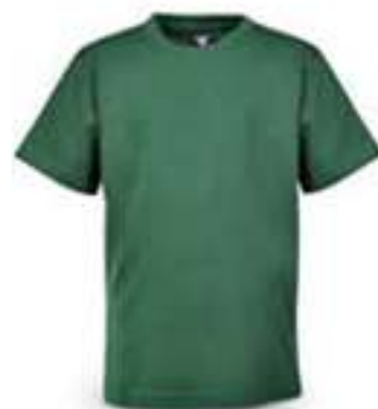
YOUTH SUPER COTTON