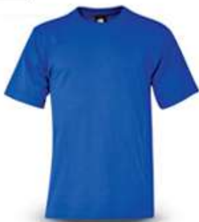
CLASSIC COTTON T-SHIRT